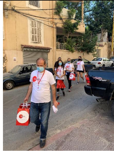
SDG 3 (Good Health and Wellbeing)