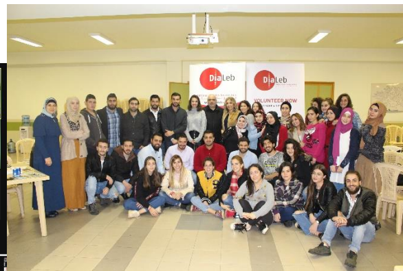
SDG 4 (Quality Education)