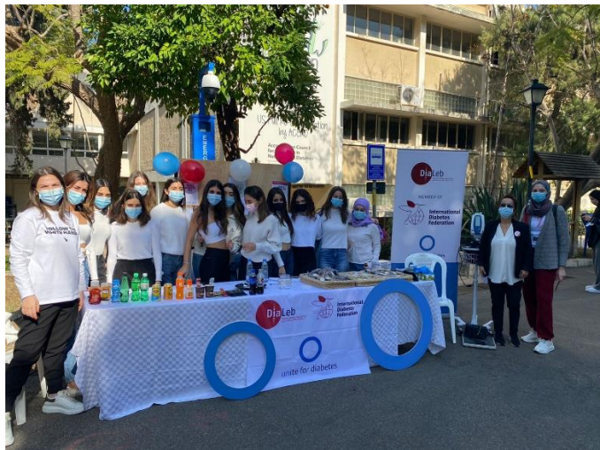
SDG 17 (Partnerships for the Goals)