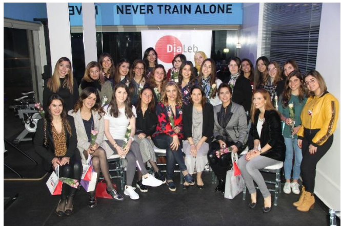
SDG 5 (Gender Equality)